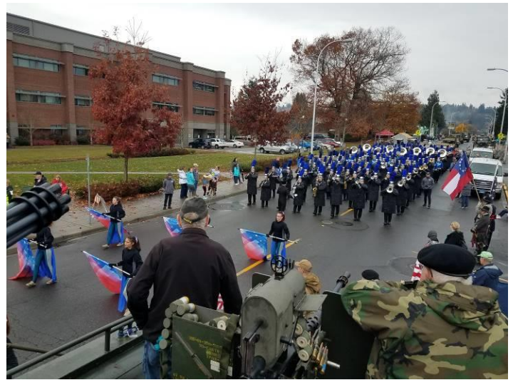
Marching bands from as far as Medford Oregon Note our working Honeywell!! Wish we had some live rounds