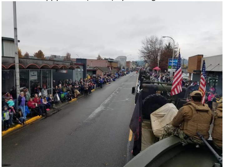
We saw large crowds on the Parade